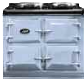
Duck Egg Blue