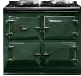
British Racing Green